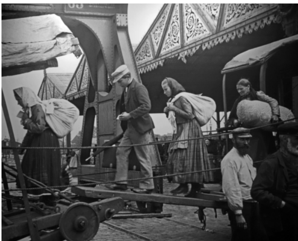
Third class passengers from Eastern Europe emigrating to the United States embarking ship of the Red Star Line in the port of Antwerp, Belgium.