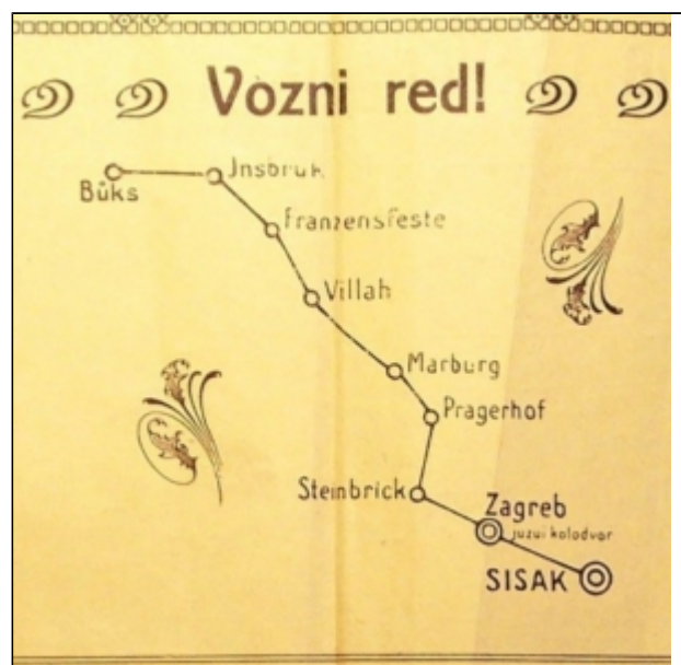
Figure 2.2 Map for the rail journey from Siska, Croatia, to Buchs, Switzerland. Detail from larger Viktor Klaus Agency newspaper ad.